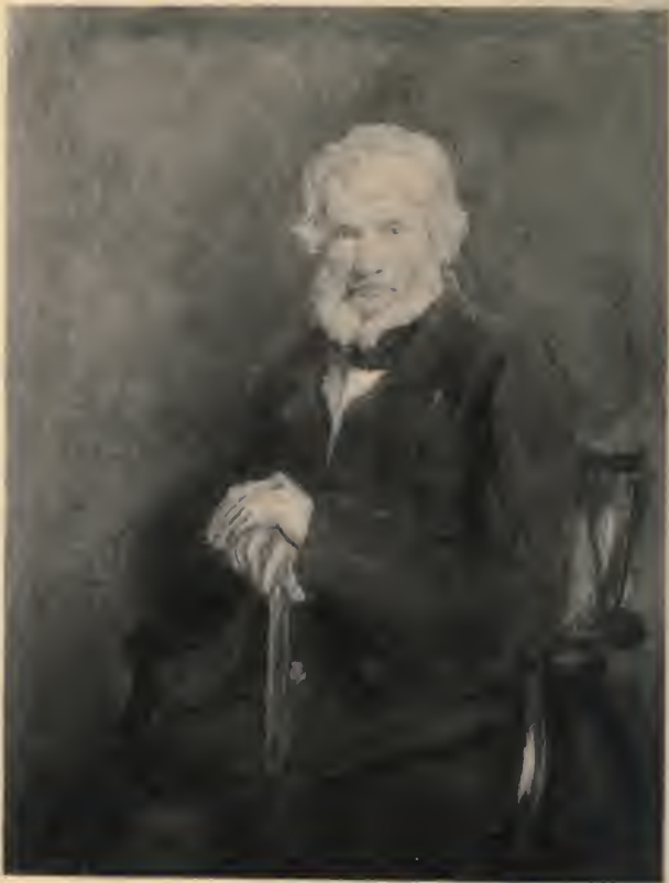
Thomas Carlyle. From the Millais portrait.